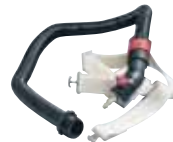
3M™ Versaflo™ Supplied Air Unit V-300