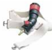
3M™ Versafo™ Supplied Air Unit V-300