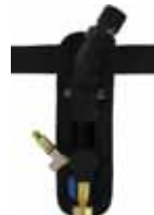
3M™ Versaflo™ Supplied Air Unit V-200