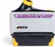
3M™ Versaflo™ Powered Air Turbo TR-800