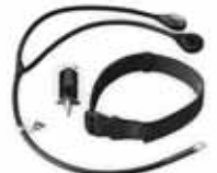
Supplied Air System Stethoscope