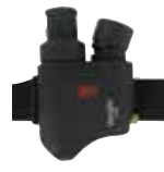
3M™ Versafo™ Supplied Air Regulator V-500