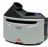
3M™ Versaflo™ Powered Air Turbo TR-300+