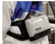
3M™ Versaflo™ Powered Air Turbo TR-600