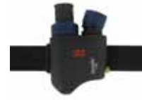
3M™ Versaflo™ V-500 Regulators V-Series