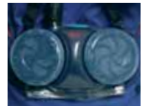
3M™ Jupiter™ Powered Air Turbo