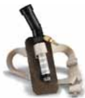
3M™ Versaflo™ Supplied Air Unit V-100