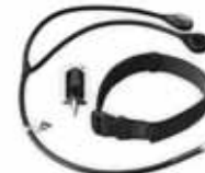
Stethoscope Airline system