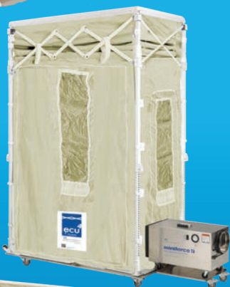
ECU4 MP4 Platform & Tow Cart