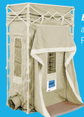
ECU4 sidewall access (SA) Flange