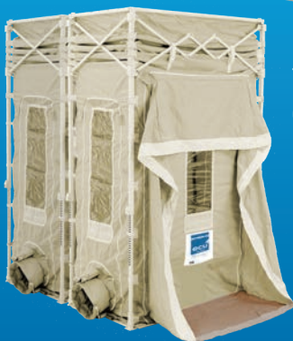
Two ECU4 's connected, modular & scalable